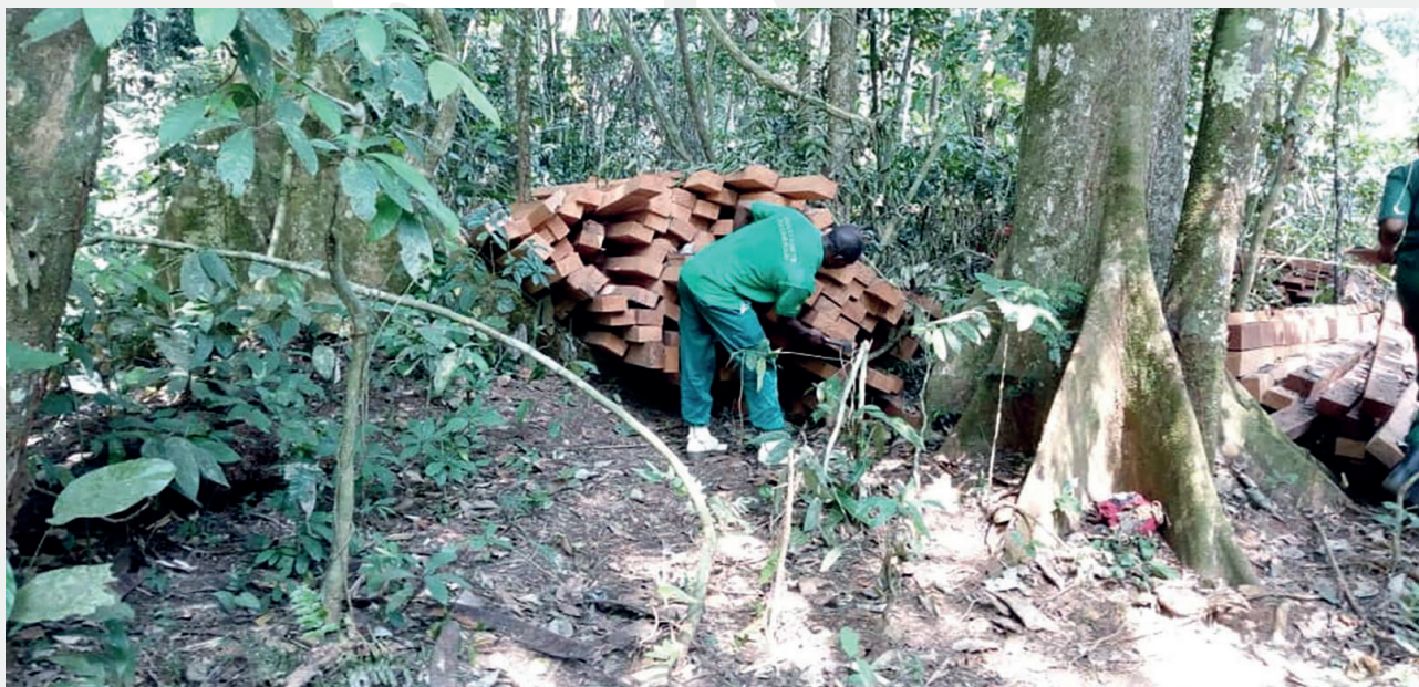
Debit stocks (242 pieces) from Sapelli seized at Kombat Tida

During the control mission of the MINFOF Regional Control Unit (BRC) for the Eastern Region, aiming to verify the forestry illegalities logging observed in the flooding area of the Mékin hydroelectric dam, no attention was taking concerning the porosity of the barrier and forest controls along the route taken regularly by the timber cut (with or without secure documents) on the Ndjibot-Bengbis-Akonolinga- Yaoundé route. However, two denunciation reports in addition to this one, were written by PAPEL on illegal activities concerning this road trip; Thus, PAPEL recommends that MINFOF integrates this component into any other forest controls that will be carried out by these agents, following any denunciation of cases of illegal logging by the local populations.