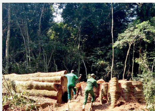
Unmarked Moabi strain in Komba Tida Ball

The reports of suspected illegal logging in the flooding area of the Mékin hydroelectric dam, transmitted to the Minister of Forests and Wildlife (MINFOF), in December 2019, caused raids of the MINFOF Regional Control Unit (BRC) for the Eastern Region. That was the