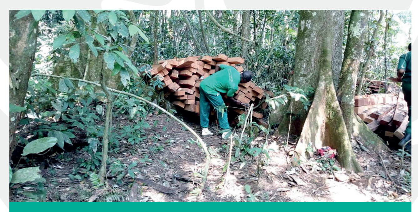
Debit stocks (242 pieces) from Sapelli seized at Kombat Tida

During the control mission of the MINFOF Regional Control Unit (BRC) for the Eastern Region, aiming to verify the forestry illegalities logging observed in the flooding area of the Mékin hydroelectric dam, no attention was taking concerning the porosity of the barrier and forest controls along the route taken regularly by the timber cut (with or without secure documents) on the Ndjibot-Bengbis-Akonolinga- Yaoundé route. However, two denunciation reports in addition to this one, were written by PAPEL on illegal activities concerning this road trip; Thus, PAPEL recommends that MINFOF integrates this component into any other forest controls that will be carried out by these agents, following any denunciation of cases of illegal logging by the local populations.