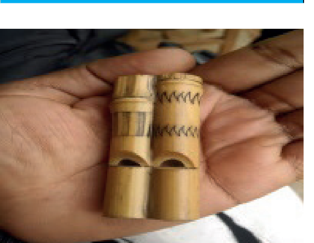
Bamboo musical instruments