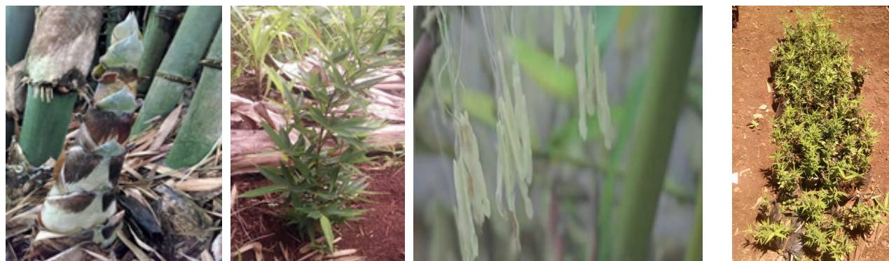
Bamboo naturally propagated

Therefore, vegetative propagation is the most popular and effective of the methods.