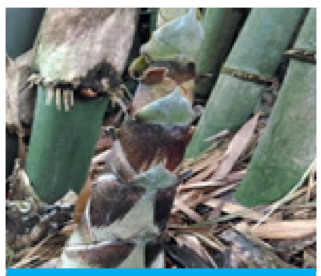
Bamboo shoot (B. vulgaris)

Bamboo shoots are used in Asia as a vegetable. Bamboo shoots are low in fat content but contain considerable amounts of carbohydrate, potassium and dietary fibers<sup>29</sup>. Their shoots generally contain tyrosine, arginine, histidine, and leucine as amino acids. The presence of high fibre and phytosterols in bamboo shoot reduces fat and cholesterol levels of blood making them one of the most sought after health foods among patients with lifestyle-related disorders<sup>30</sup>. With 17 different types of amino