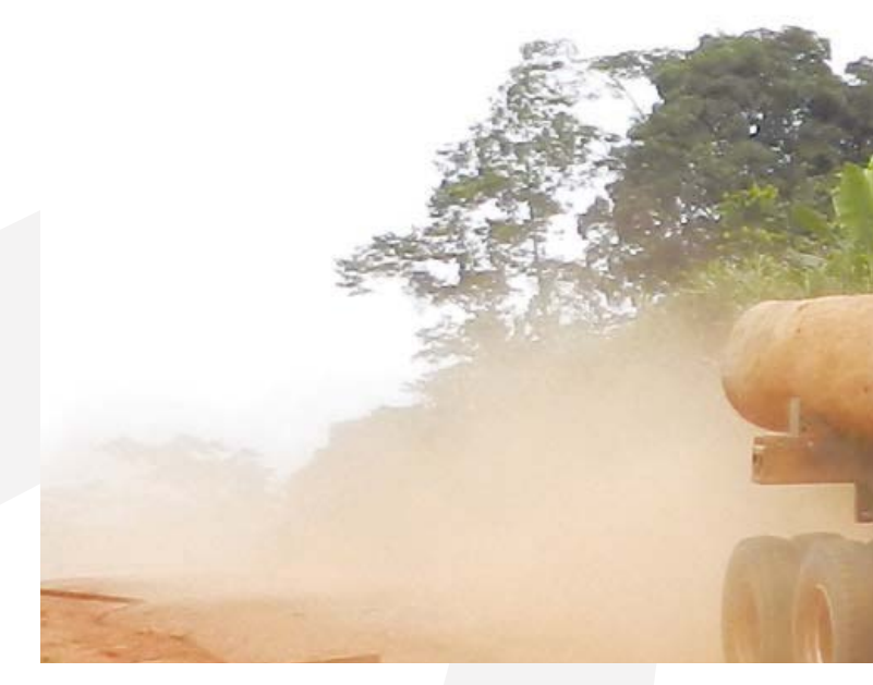
following offences: unauthorized exploitation in a National Forest Estate ...»

These facts of exploitation beyond the limits of the logging stand VERA forestière is found guilty of, are repressed by the Law n°94/01 of January 20, 1994 on forestry, wildlife and fishery in its section 157 which states that «A fine of from 3,000,000 to 10,000,000 CFA francs or imprisonment for from six months to one year, or one of these two sentences shall be imposed on whoever commits any of the